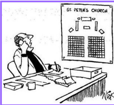
"The best I can do for Easter is three together in the ninth row" Adapted from The Tablet c/o George Murphy

Start digging the garden plot as you can plant lettuce starters first week of April. Six packs of lettuce, (three varieties) $5 pick up now. Geraniums, 4 colors, plus lemon scented, $6 order now for May 15 pickup. Hanging baskets, 5 left $50, again May 15 pickup. Don't forget the best tomatoes in Gordon Head, 3 varieties $4, May 20 planting. Assorted flowers, daisies, marigold and sunflower for planting May 15. And of course zucchini green and yellow, $4 and the FREE PUMPKINS for little people! Happy to plant your patio pots...seems to be popular and keeps me busy and out of the kitchen!! THANKS in advance for your support, ALL PROCEEDS FOR MT.ST.MARY HOSPITAL Ellis 250-477-6754 or by email eachtem@shaw.ca