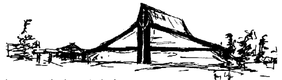
holy cross church garden head rd. Victoria, b.c.

Masks are now optional, with the exception of those not yet vaccinated, in the church and parish centre.