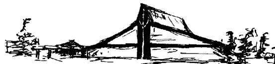
holy cross church garden head rd. victoria, b.c.