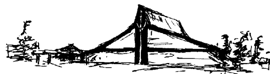
holy cross church garden head rd. victoria, b.c.

Masks are now mandatory everywhere at all times.