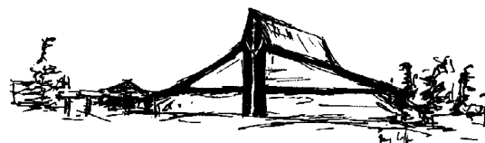
holy cross church garden head rd. victoria, b.c.

Update: There will be only half capacity allowed in the church, which is 140 people at Holy Cross. Ushers will be counting people as they enter and will lock the doors when capacity is reached. Masks are now mandatory everywhere at all times.