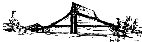
holy cross church garden head rd. victoria, b.c.

Masks are now mandatory in the church and parish centre at all times.