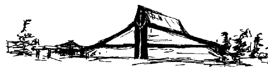
holy cross church garden head rd. victoria, b.c.

Masks are no longer mandatory indoors, though we do encourage those who feel more comfortable to wear them as needed. As always, if you are feeling unwell or symptomatic please stay home.