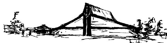
holy cross church garden head rd. victoria, b.c.

Masks are no longer mandatory indoors, though we do encourage those who feel more comfortable to wear them as needed. As always, if you are feeling unwell or symptomatic please stay home.