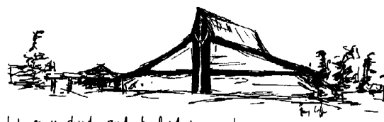
holy cross church garden head rd. victoria, b.c.

Masks are now optional, with the exception of those not yet vaccinated, in the church and parish centre.