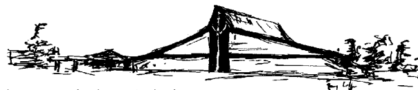
holy cross church garden head rd. victoria, b.c.

St. Patrick's Parish - Sunday 11am and 4pm. Weekday Masses Wednesday and Friday 12:10pm.