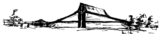
holy cross church gordon head rd. victoria, b.c.