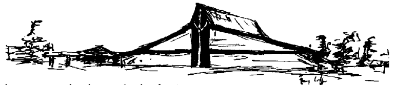
holy cross church garden head rd. victoria, b.c.