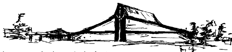
holy cross church garden head rd. victoria, b.c.