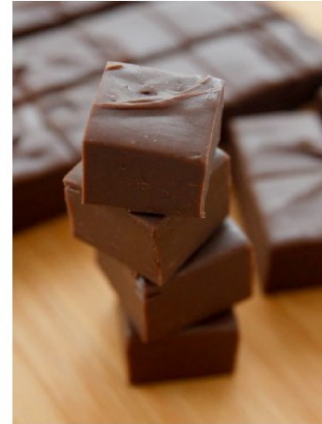
MIDNIGHT MINT: silky dark chocolate with a hint of crème de menthe (no alcohol)