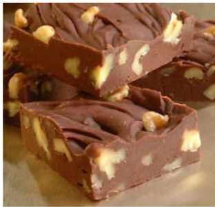
CHOCOLATE WALNUT: a softer, sweeter, more traditional fudge