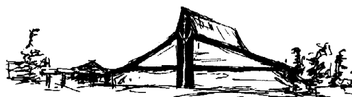
holy cross church garden head rd. Victoria, b.c.

Masks are now mandatory for everyone in the Church and the parish centre.