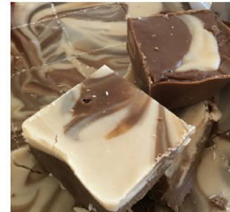
ROOT BEER FLOAT: a very pretty fudge, decadent chocolate with the taste of Root Beer over ice cream!

CHOCOLATE APRICOTS: hand-dipped, dried Apricots. A tarter taste for those who like their chocolate less rich. $3