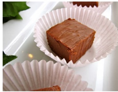
CLASSIC CHOCOLATE: softer, sweeter, more traditional, (no nuts but prepared in a home kitchen ~ trace amounts may be present)