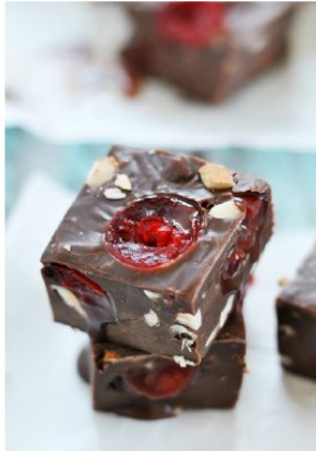
BLACK FOREST: our best-seller, dark chocolate, cherries almonds

All Birthright Fudges* are $5 (each package = 1/4 of an 8 inch square pan).