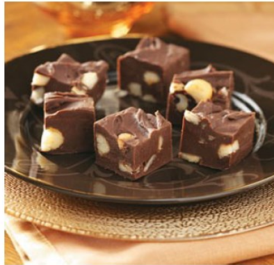
MACADAMIA MADNESS: dark chocolate, macadamias (size is a little smaller as the nuts are pricey)