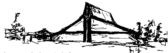
holy cross church garden head rd. victoria, b.c.