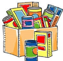
Feeding the Community

With the colder weather approaching Anawim House is looking to re-stock it's depleting shelves. They are in particular need of: canned goods (for example, pork and beans, tuna, canned pasta, etc), dried pasta, jarred pasta sauce, cereal, peanut butter for sandwiches, are in very high demand right now.