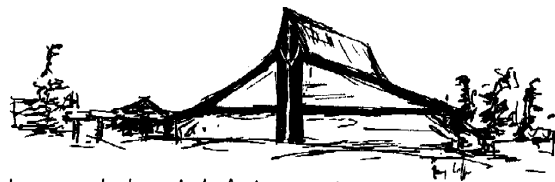
holy cross church garden head rd. victoria, b.c.