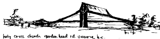
holy cross church garden head rd. victoria, b.c.