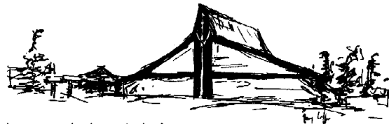
holy cross church garden head rd. victoria, b.c.